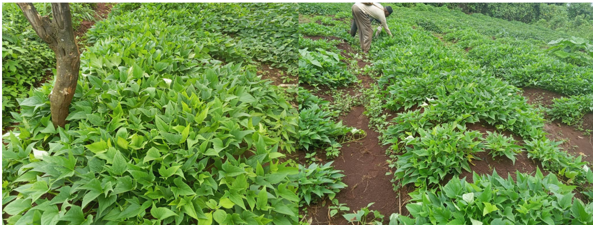
EJUMULA nursery bed