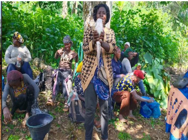
Fish Pond in Big Babanki