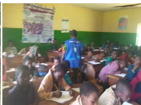
Monitoring activities in Babessi sub division