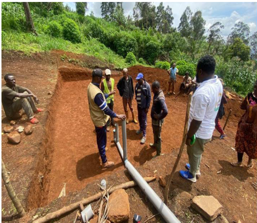
Fish Pond In Nzah