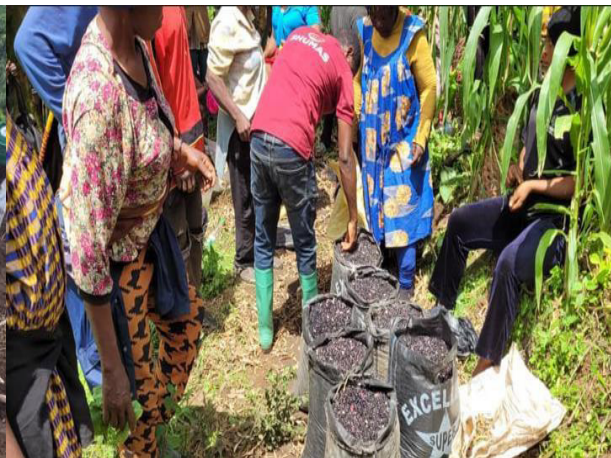
Harvesting of beans in Big Babanki