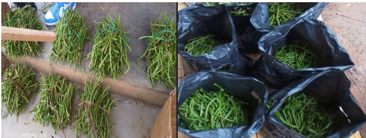
Counting and packaging of vines for distribution