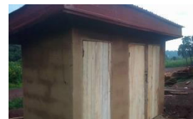
New constructed toilet