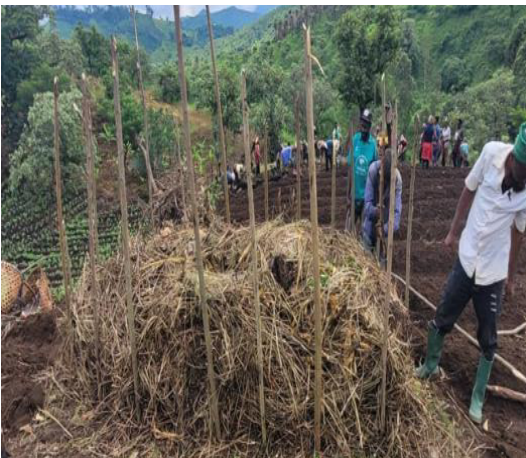
Making of compost heap in Big Babanki