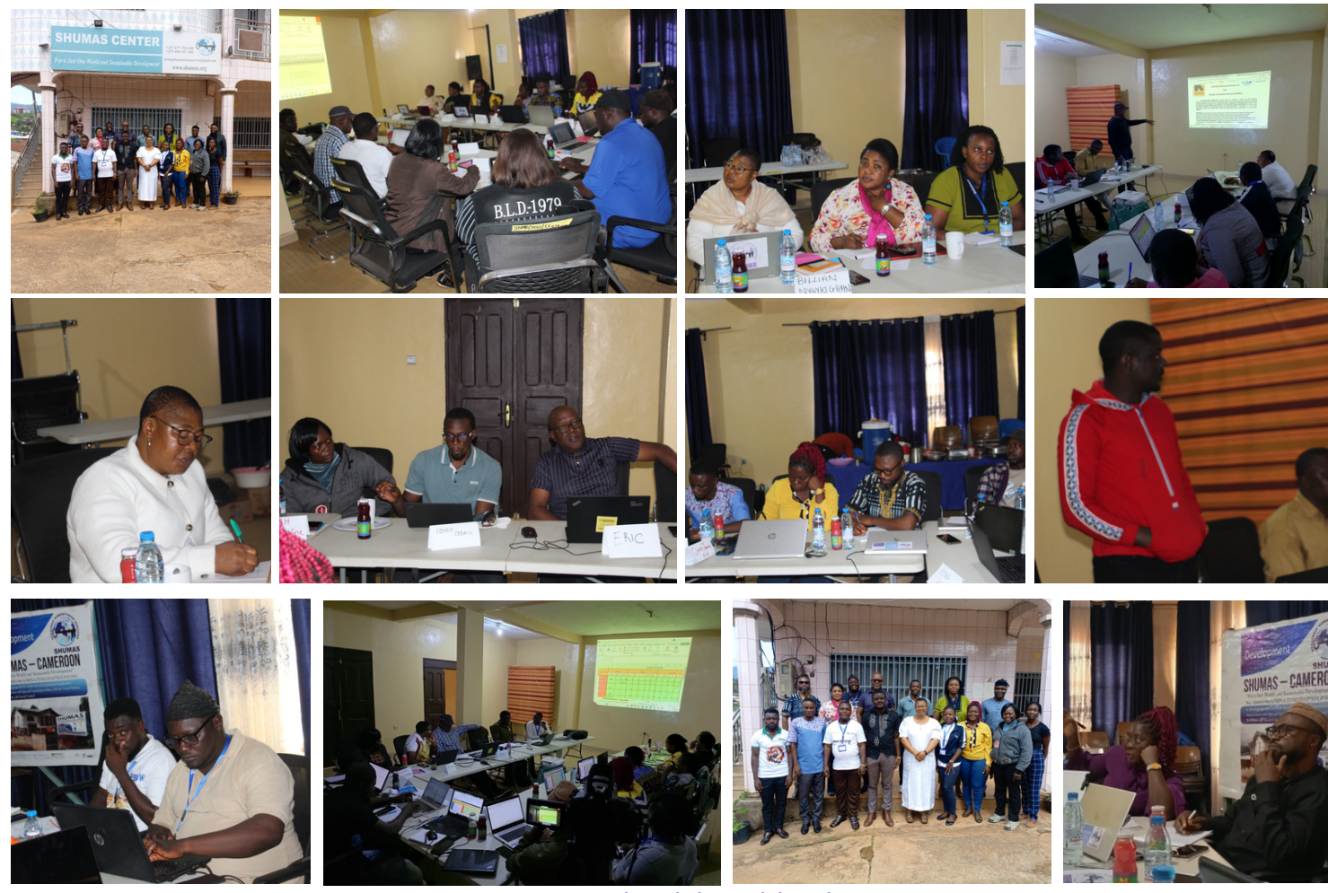
Four Days Capacity Building Training with IRC

The partnership between SHUMAS and the International Rescue Committee (IRC) reached new heights with a four-day capacitybuilding training focused on programming, financial management, reporting, monitoring, and evaluation among others. This training serves as a preparatory step for an early recovery humanitarian project in Bamenda, funded by IRC and implemented by SHUMAS.