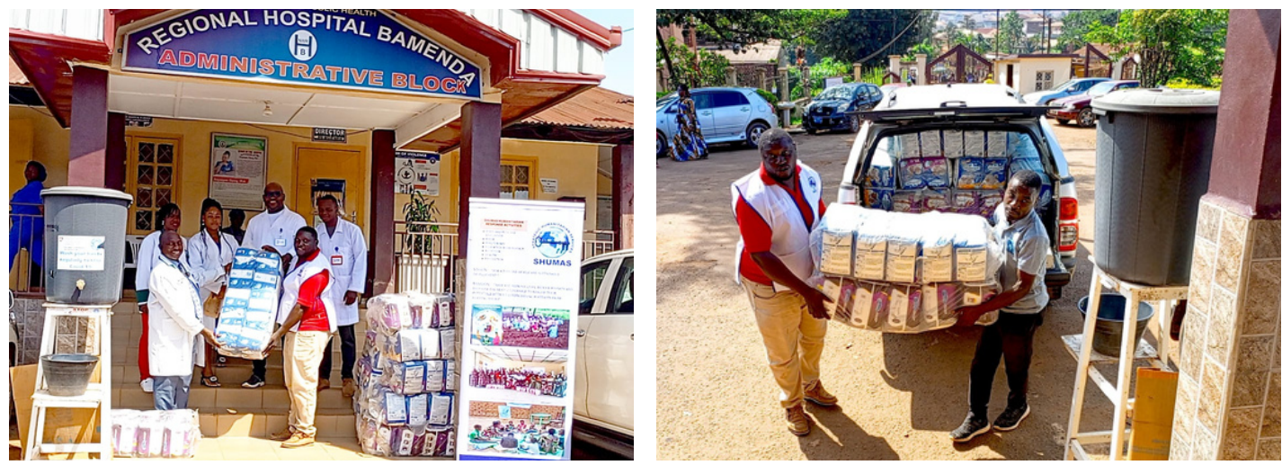
Distribution at North West Regional Hospital, Bamenda

SHUMAS has strengthened patient care at the Bamenda Regional Hospital with a timely donation of 1,000 adult diapers. This support addresses a critical yet often-overlooked need, especially for bedridden, incontinent, and critically ill patients, including those in the ICU. These items are often beyond the financial reach of many families, making this donation a major relief for both caregivers and patients. The Hospital Director expressed heartfelt gratitude, highlighting the positive impact on patient dignity and hygiene. Though a one-time contribution, this gesture reflects SHUMAS's continued commitment to supporting essential healthcare needs and improving the well-being of the region's most vulnerable patients.