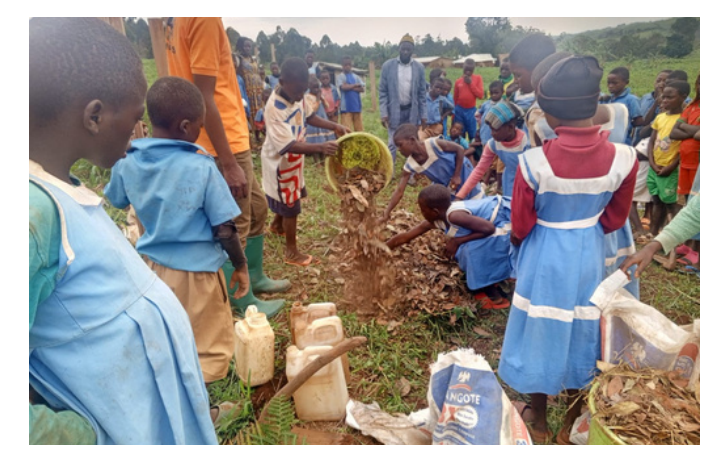
Pupils working in the garden