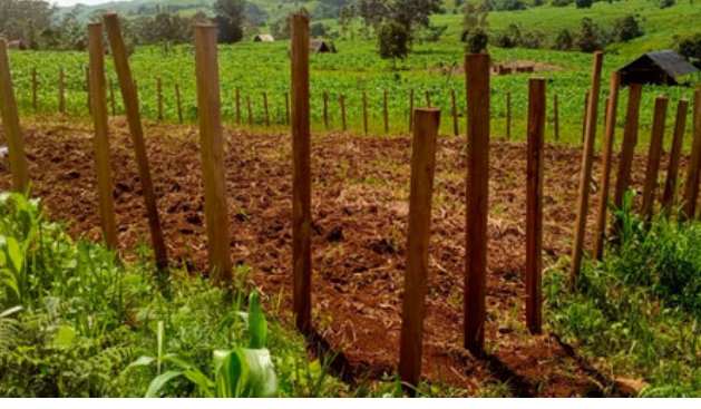
School Garden under construction

Since about 90% of the children's parents are farmers, the knowledge gained at school is likely to be shared and practiced at home. This creates a ripple effect, spreading sustainable farming practices throughout the community and strengthening the link between what children learn and how their families live.