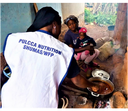
Cooking Demonstration during home visits in Bal

Since early 2025, over 1,000 nutrition demonstrations have been conducted across communities such as Bali, Njong, Mbe, Mbengwi, Nkambe, Kungi, Ndzah, Menteh, Sabga, Baforkum, Binshua, Tubah, Small Babanki, and Big Babanki. These sessions equip beneficiaries with skills to prepare nutrient-rich meals using locally available ingredients, including techniques like super cereal preparation, maintaining proper water-to-food ratios, and creating 5star meals. The initiative is designed to fight malnutrition and promote sustainable nutritional practices within vulnerable communities.