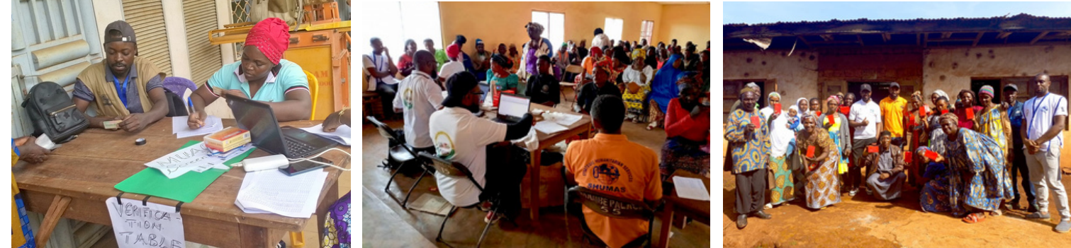
Physical verification sessions in Mbenawi and Nkambe

Beneficiaries continue to actively implement the project through the creation and maintenance of community assets, including farms, fish ponds with water wells, poultry farms, warehouses, and feeder roads. These efforts are boosting food security, income, and long-term resilience in crisis-affected communities.