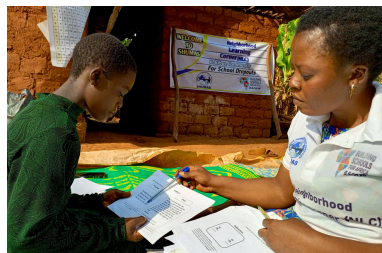
Baseline assessment in Babessi

SHUMAS, in partnership with Building Schools for Africa, has launched an innovative initiative to provide educational opportunities to out-of-school children in the North West and West Regions of Cameroon. The "Access To Education Through The Creation Of Neighborhood Learning Corners" project targets vulnerable out-of-school children, providing them with free training using radio programs and the "Teaching at the Right Level" (TaRL) approach for six months. Upon completing the program, school drop outs are transitioned into formal schools, where they will receive free educational materials and tuition fees.