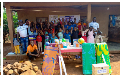
Neighborhood Learning Corner Galim