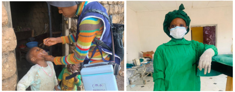
Spreading Health nurses deployed to serve in their communities

SHUMAS, in partnership with Spreading Health UK, is improving healthcare access in underserved communities in Cameroon. The project trains local nurses –midwives through scholarships and mentorship and redeploys them to serve in their communities for a minimum period of 3 years. Up until now, over 80 students have been trained and deployed to 80 communities nationwide. Birthing kits have been distributed to vulnerable and minority women in crisis affected communities of the North West and Far North Regions. Over 450 kits have distributed up until now.