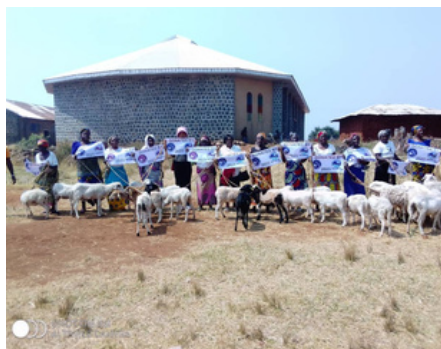
Some happy beneficiaries post with their animal and crop produces

SHUMAS and Manos UNIDAS, Spain have empowered 200 vulnerable, crisis-affected female-headed households in Bui Division through training on sheep production, pasture improvement, market gardening, and human rights. The project has made provision for 400 mature female sheep, 25 rams, crops and vegetable seeds, farm tools, improved pasture seeds, materials to construct sheep barns and paddocks to the 200 women-led families. Meanwhile, additional support included, Psychosocial support (PSS), basic numeracy and literacy lessons and registration as a cooperative.