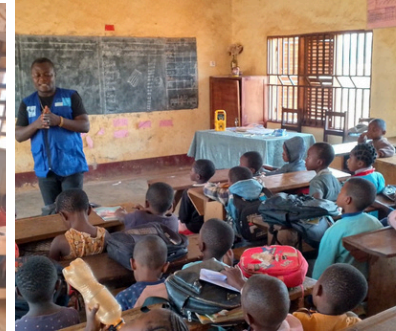
Monitoring in Mezam Division, North West Region, Cameroon