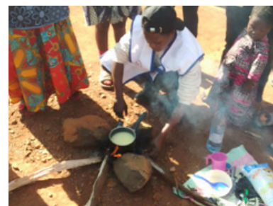
Cooking démonstration with CSB + +