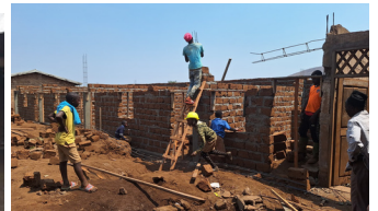
3 - Classrooms under construction