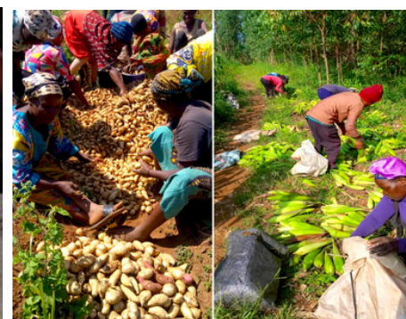
Harvesting of crops