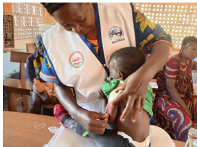
Screening for Malnutrition

SHUMAS' WFP-funded Emergency Project to Combat Food Crisis / Nutrition Project in the North West Region, Cameroon reached 661 caregivers with nutrition messaging (Infant and Young Child Feeding in Emergency), Screened 1,078 children for malnutrition, monitored 1,063 children 6-59 months' diets through, conducted 66 cooking demonstrations during home visits and 26 positive deviance sessions in targeted communities. 11 children with Moderate Acute malnutrition were successfully managed.