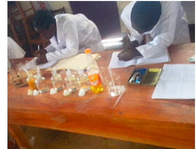
Science students in Kumbo making use of the Lab