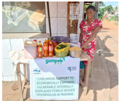
Some E3 beneficiaries