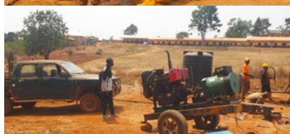
GBHS Kumbo Borehole : Work in Progress