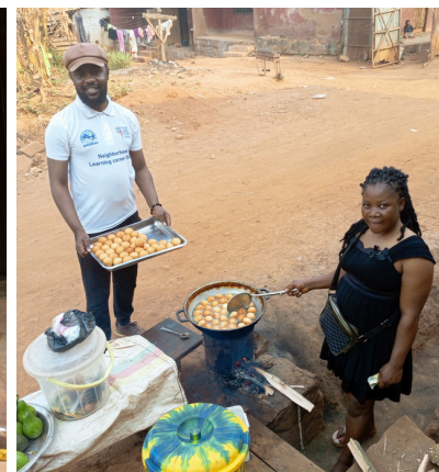
Some E3 beneficiaries