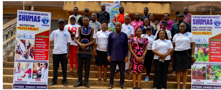
SHUMAS Coordination Meeting for WFP Food Security Project

The final quarter coordination meeting of the WFP Food Security Project, implemented by SHUMAS was held with an assessment of project achievements, lessons learned, and future planning. Yielding recommendations for improved targeting, collaboration, control, and inputs with stakeholders were made. The project aims to achieve "zero hunger" by enhancing productivity, nutrition, and market opportunities for small-scale farmers.