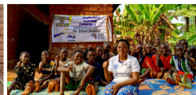
Neighborhood Learning Corner, Kokibue