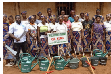
Distribution of NFIs in Kungji project site

The Smallholder Agricultural Market Support (SAMS) program, a collaboration between WFP and SHUMAS, is transforming lives in Cameroon's North West Region. In February, the program has continued to empower 700 smallholder farmers in 27 cooperatives across 3 divisions. This project notably also facilitated the extraction and sale of 7,519L of milk, generated savings of 931,100 FCFA through Village Saving and Loan Associations, and distributed agricultural tools to 11 cooperatives, promoting agricultural productivity and economic growth.