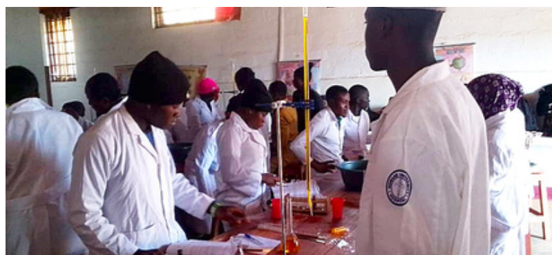
Science students in Kumbo making use of the Lab

As official examinations draw nearer, Secondary Schools in Cameroon have begun science practicals in Pre-Mock and Mock preparatory examinations. SHUMAS in collaboration with Citibank have created a science laboratory well equipped with Biology, chemistry, and physics equipments to help students in the crisis stricken Bui Division. Over 700 students from 9 secondary/highs schools around kumbo are benefiting from this project as they prepare for official examinations. The interest to pursue science options and general performance of science students in public examinations has significantly improved since the creation of the Science Laboratory.