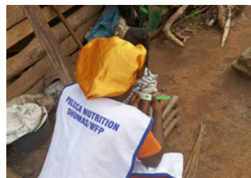
Screening for Malnutrition

SHUMAS' WFP-funded Emergency Project in Cameroon's North West Region has achieved notable success in combating the food crisis and addressing malnutrition, reaching 661 caregivers with nutrition messaging, screening 1,078 children for malnutrition, and monitoring 1,063 children's diets, with 11 cases of Moderate Acute Malnutrition successfully managed through cooking demonstrations and positive deviance sessions.