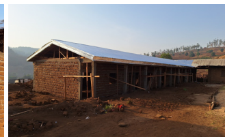
3 - Classrooms and 3 compartment toilets under construction