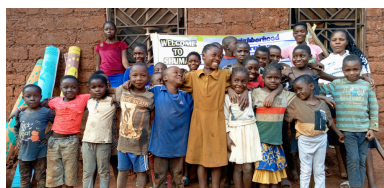
Ndokong Neighborhood Learning Corner, Ntse Nkwobaw

SHUMAS has continued to improve access to education for 260 out-of-school children (OOSC) in Cameroon's Babessi (NORTH West Region) and Galim (WEST Region), where the ongoing crisis has left many internally displaced persons (IDPs) without income, making tuition fees impossible to afford. Also, many children are reluctant to attend school because their parents/caregivers are struggling to provide basic needs due to lost livelihoods. Even the parents prioritize labor over education, leading to child labor. In partnership with Building Schools for Africa (BSFA), SHUMAS is providing a lifeline through the Trauma Relief TaRL teaching methodology and recreational activities in 7 Neighborhood Learning Corners, ultimately enabling the children to regain desire for education and transition into formal schools.