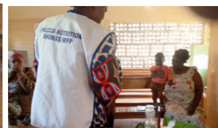
Positive Deviance Sessions

SHUMAS is dedicated to upholding the highest standards of humanitarian principles, as outlined by the United Nations. We adhere strictly to the policy of "DO NO HARM" in all our interventions, ensuring that our actions bring relief and support to those in need, without causing harm or perpetuating inequality. If anyone claiming to represent SHUMAS requests financial, material, or any other form of compensation in exchange for our services, please report them immediately. This behavior is contrary to our values and principles. To ensure the authenticity of any SHUMAS representative or to report suspicious activities, please contact us directly at