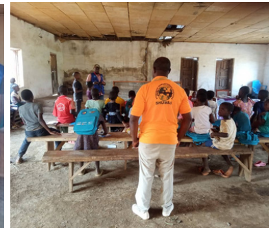
Monitoring of Project Activities in Bafut and Menchum