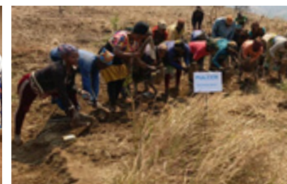
Land preparation by "Unity is Strength" Cooperative, Nkambe