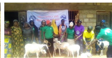
Second generation beneficiaries