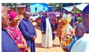
SHUMAS DG and Catholic Education Board Secretary Welcomed