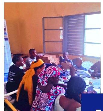
15 Adolescent Girls in practical sandals making session