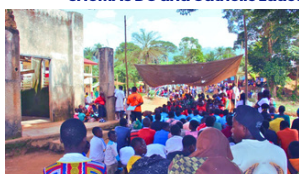
Cross section of community members