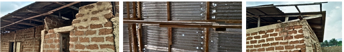
School Structure Before