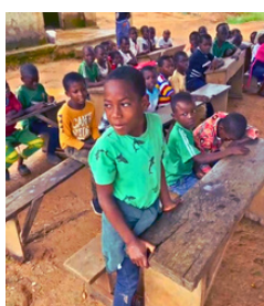
Pupils studying in open air before