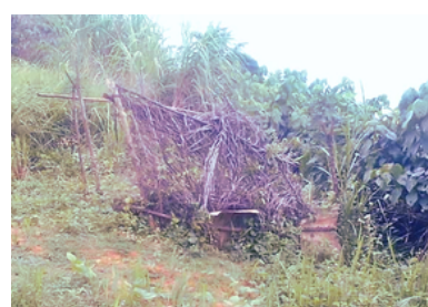
Terrible school toilet before