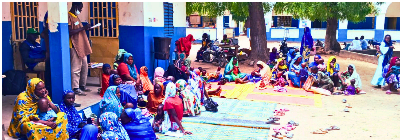
Mental Health sensitisation at Madiako