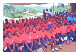
Cross section of pupils