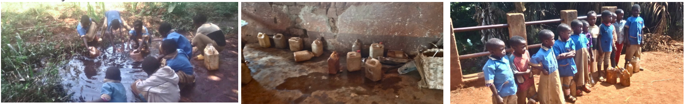
The Water, Sanitation and Hygiene situation at EP Bagam Before