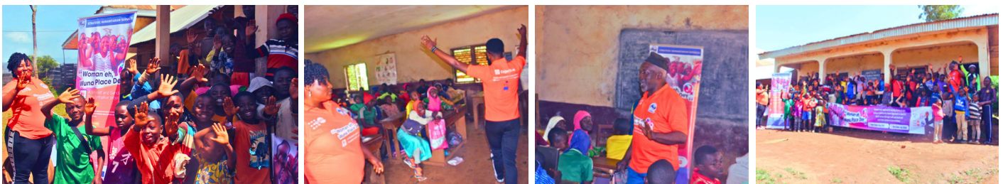
GBV Sensitisation session in a primary school in Bui