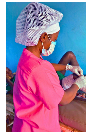
This is Nurse Otans serving in Funfuka CMA