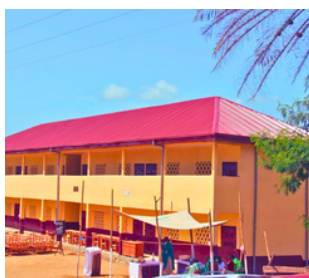
Classroom block after