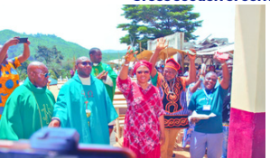
Cutting of ribbon and symbolic handing over