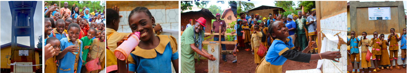
The Water, Sanitation and Hygiene situation at EP Bagam After