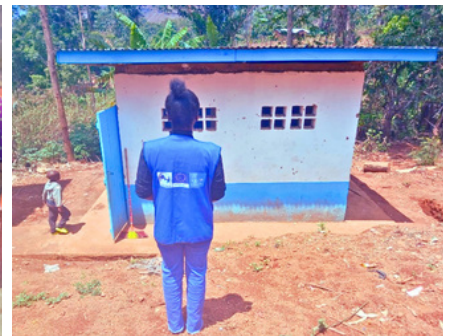
SHUMAS Staff on field monitoring of Radio Education Program in the North West Region