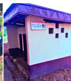
School toilet after