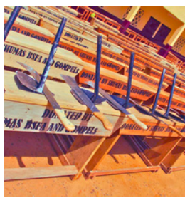
Benches, chairs and farm tools