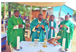
Cross section of Religious Authorities